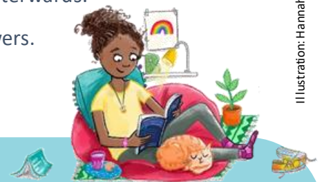
Illustration: Hannah Shaw

https://www.booktrust.org.uk/news-and-features/features/2020/june/how-to-help-your-children-return-to-school-5-top-tips/