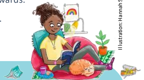
Illustration: Hannah Shaw

https://www.booktrust.org.uk/news-and-features/features/2020/june/how-to-help-your-children-return-to-school-5-top-tips/