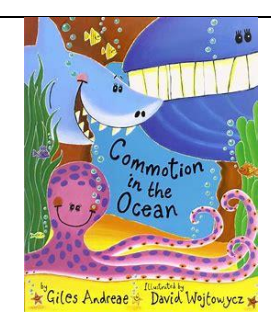
Personal, social and emotional development-

Read/listen to the story <u>Commotion in</u> the ocean. At the end, ask, 'What did you see?' For younger children describe what you did see.